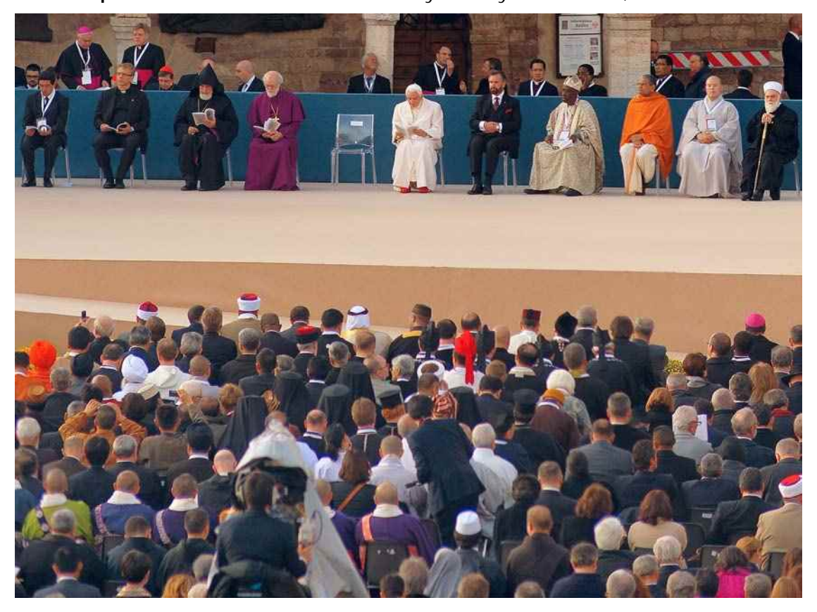
Pope Benedict XVI at the World Day of Prayer for Peace, Assisi 2011

Then, five years later, in turn, Pope Francis organized a new meeting in Assisi on <u>20 September 2016</u> (30th anniversary of the first meeting in Assisi).